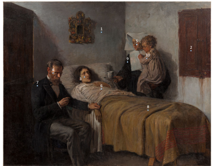
Fig. 1. Painting "Science and Charity" (MPB 110046) with the investigated spots.

This study started with a visual investigation of the various colours the young Picasso used in the four paintings to stylistically structure them; subsequently, ten spots (areas with a diameter of 3 mm) were selected on the same zones of each painting to be measured by using a spectroradiometer (Figs. 1-4). The aim was to discover if there were any associations in the painted scenes – in the painting and the three oil sketches—between the measured colorimetric values, the chromatic painting balance, and the colour perception of MPB conservators so as to gain an enhanced understanding of the conditions of these artworks.