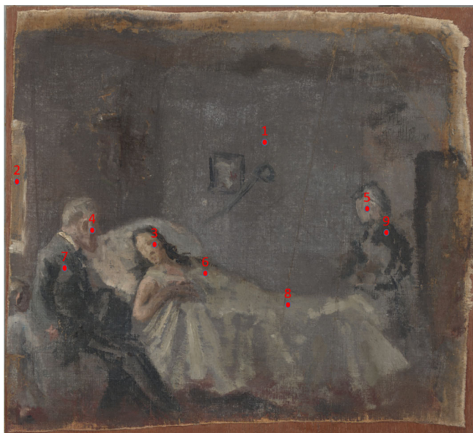
Fig. 2. Painting MPB 110099 with the investigated spots.

better understanding of the condition of the painting. In 2018, these four paintings were analysed by using the following spectroscopic techniques: visible (Vis) and near infrared (NIR) fibre optic reflectance spectroscopy (FORS), in the 350-2200 nm range, on different spots on the painting surfaces; reflectance hyperspectral imaging (HSI) in the 400-900 nm (VNIR) and 950-1650 nm (SWIR) ranges (HSI on the painting Science and Charity, MPB 110046, was acquired only in the SWIR region). Furthermore, measurements focused on the colorimetric data on 10 selected spots were also recorded by using a Konica-Minolta CM700d spectrophotometer (Konica Minolta 2008). In addition, in 2010 a set of micro-samples taken only from the painting "Science and Charity" (MPB 110046) had already been analysed by using scanning electron microscope (SEM) and Fourier transform infrared (FT-IR) techniques. In this paper, however, it was decided to report the colorimetric data only.