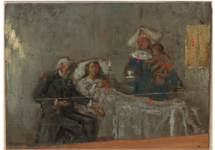
Fig. 3. Painting MPB 110229 with the investigated spots.

The main character of the composition, the doctor, is here not seen in profile but portrayed in a three-quarter view like in the final big canvas painting. However, there is still a big difference between this and the final version: here, like in the first sketches, including the watercolour (MPB 110089), the doctor's hair is white. In addition, the window is positioned on the right section of the scene.