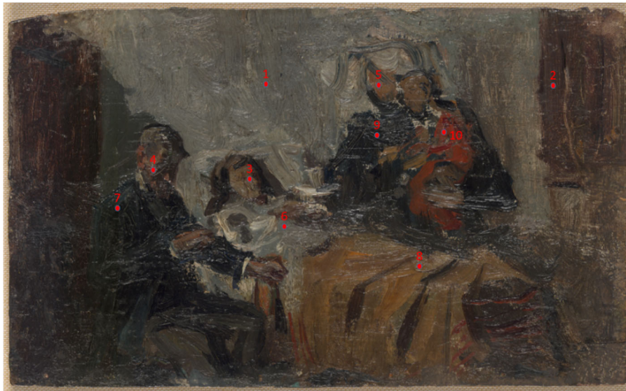
Fig. 4. Painting MPB 110214 with the investigated spots.

Measurements of the chromatic parameters were carried out with the spectrophotometer Konica-Minolta CM-700d model (Fig. 5). This instrument measures reflectance spectra with an acquisition step of 10 nm in the 360-740 nm range. Measurements were acquired using the geometry of diffuse lighting, angle of view of 8° with respect to the normal and exclusion of the specular component, using the 3 mm in diameter probe-head (Konica Minolta 2008). The colorimetric data reported in this work were calculated in the CIEL*a*b* 1976 colour space for the 10-Supplementary Standard Observer (1964) and daylight D65 illuminant (table 2) (Wyszecki and Stiles 1982, CIE 1982, ISO/CIE 10526 and 10527 1991).