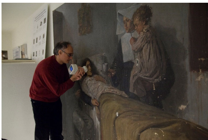
Fig. 5. Acquisition of colour measurements on the Science and Charity painting, final version.

The 'atmosphere' of the scene is most strongly conveyed through the hue used to paint the walls of the room. The data obtained from the four paintings showed no noticeable discrepancies: an inhomogeneous medium-light grey hue on the main wall that is more neutral (achromatic) for the first sketch and the final paintings than the other two intermediate sketches, which instead present a bluish predominance.